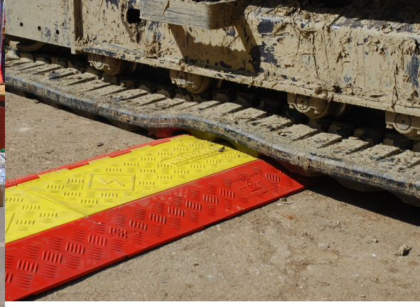
PICTURED: CP5X125 IN-USE (LEFT) CP5X125 IN USE (TOP)

Checkers<sup>TM</sup> cable management offers the most extensive line of high-performance cable/hose protection products in the world. These durable cable protection systems provide a safer method of passage for pedestrian traffic, vehicles and heavy-duty equipment while protecting valuable electrical cables, cords and hose lines from damage.