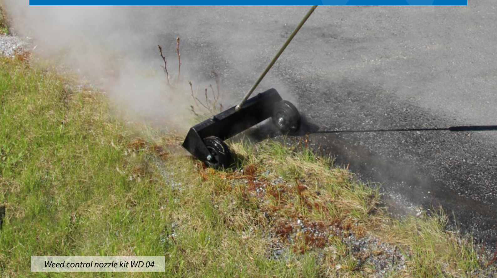
Weed control nozzle kit WD 04