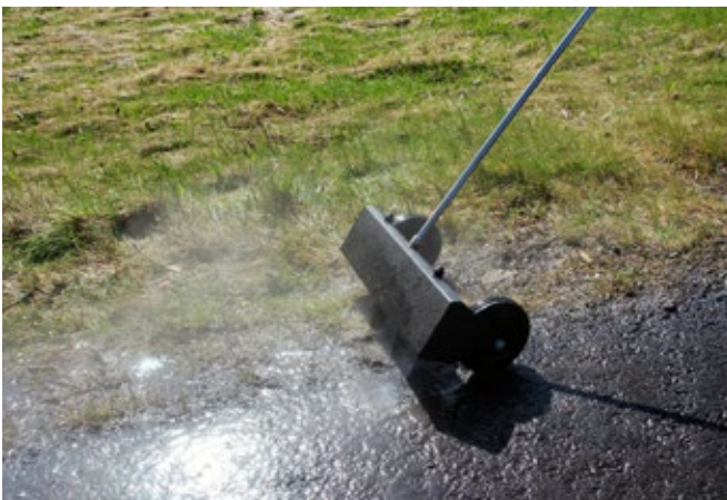
Optional weed control nozzle kit WD 04