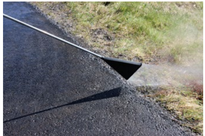
Optional weed control nozzle kit WD 01