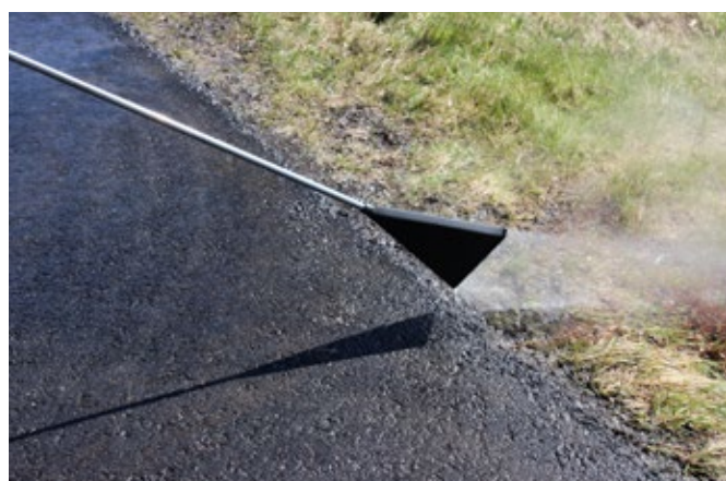
Weed control nozzle kit WD 01

The WeedStriker™ is equipped with a hot water boiler and a 12V pump that is controlled with StrikeSmart™ Smartphone App (Phone included) which also can be connected to the cloud based HTrack™ system .