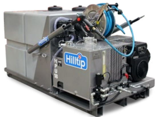
Power Jet-It™ Combi 1000 l

The Power Jet-It™ Combi is designed for installation onto pickups, flat beds, trailers and other similar vehicles. The Combi unit is available in two different watertank capacities, 500L and 1000L. The total length of the 500L model is only 135cm. This makes it fittable on even Double-Cab Pickups!