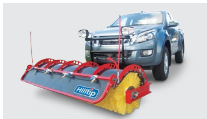
SweepAway™ rotary broom on pickup