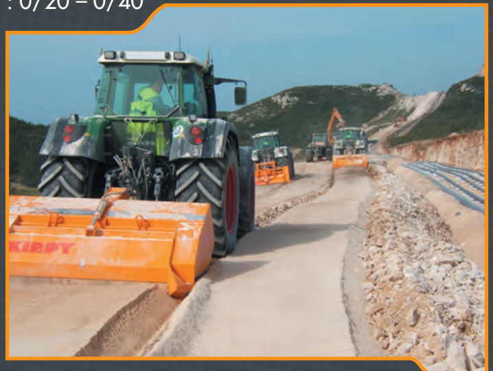
PIPE-LINE LAYING : CRUSHING OF EXCAVATION PRODUCTS FOR LAYING BEDS AND COVERING (PATENTED).