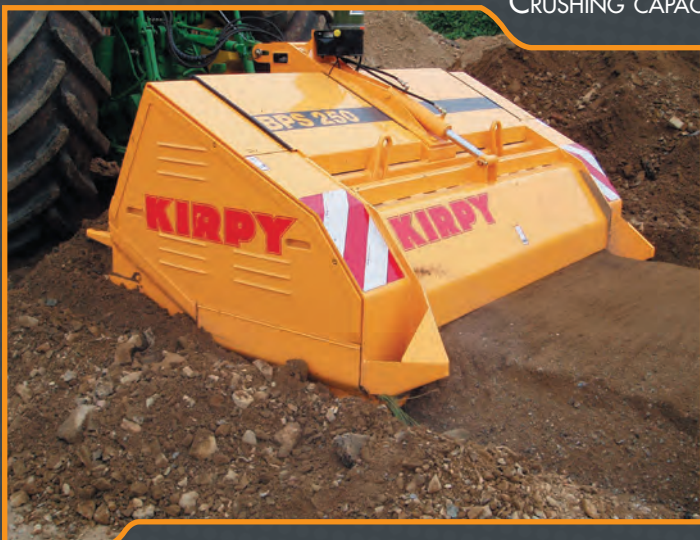
FORESTRY WORK: CREATION AND REPAIRS TO FOREST PATHS OR FIRE BREAKS.

CRUSHING WITH CLOSE ANVIL : CRUSHING CAPACITY : 0/20 – 0/40