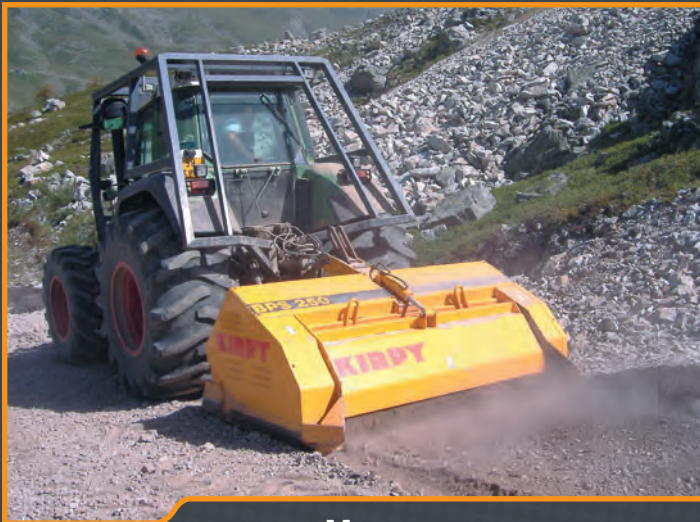
MOUNTAIN CRUSHING WORK: MARKING OUT AND PREPARATION OF SKI PISTES

CRUSHING WITH CLOSE ANVIL : CRUSHING CAPACITY : 0/20 – 0/40