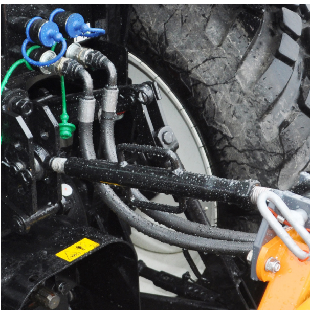
PM 1,4 powered by a hydraulic pump.