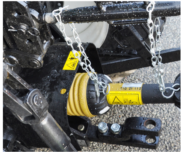
PM 1,4 powered by the tractor's PTO.