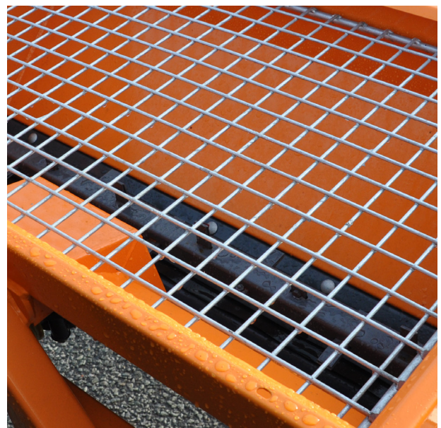
The safety grate prevents unwanted access to the agitator and distributor roller.