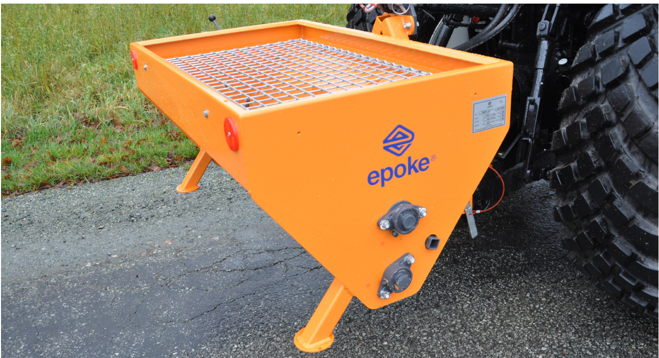
The PM series is ideal for fitting to smaller carrying vehicle with three-point suspension category 0/1.

The PM series undergoes the same thorough surface treatment as all other Epoke spreaders, meaning the spreaders are well protected against rust.