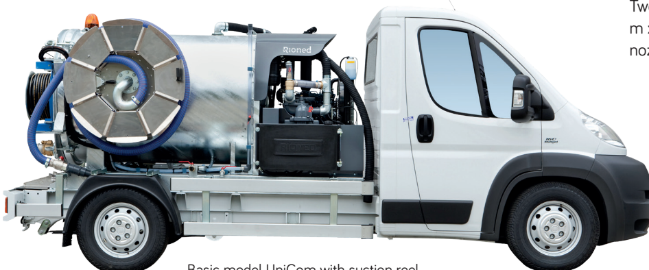
Basic model UniCom with suction reel

Two suction hoses, including couplings, 60 m x NW 13 high pressure hose and two jet nozzles make the package complete.