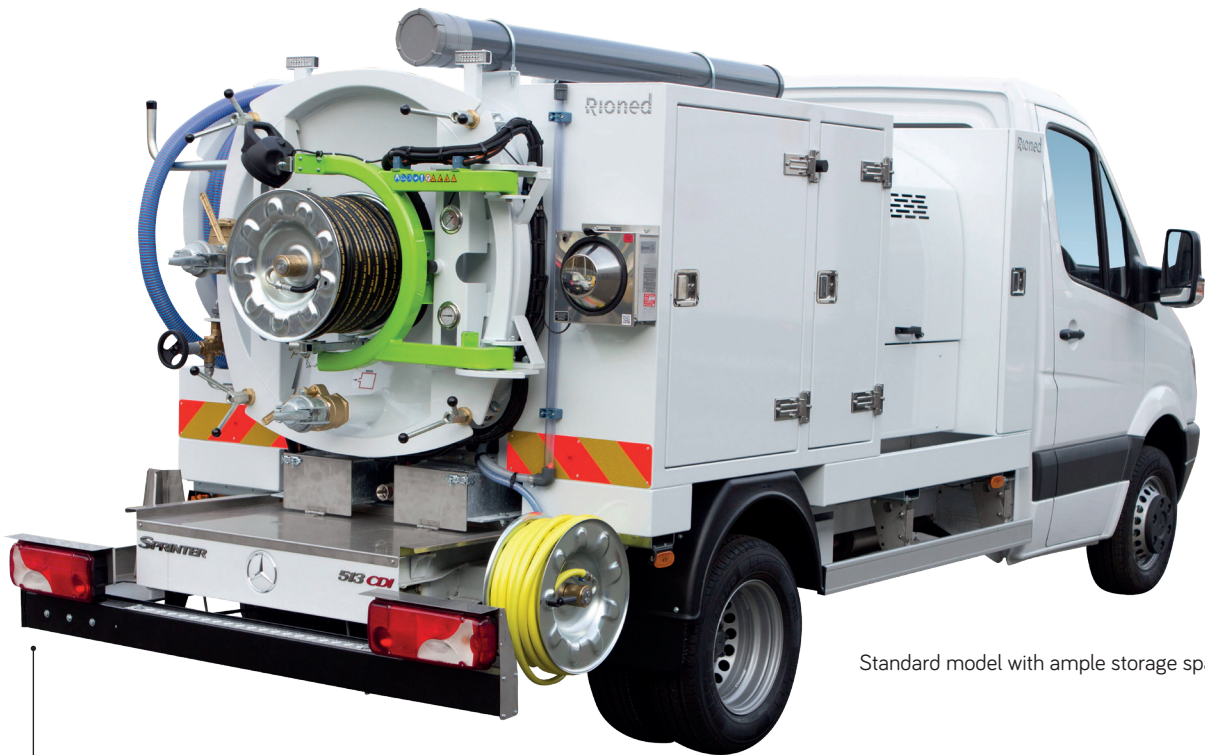
Standard model with ample storage space