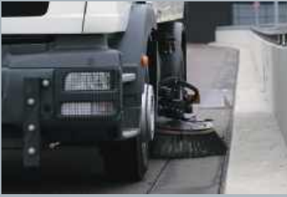
Disc brooms on right and left-hand sides