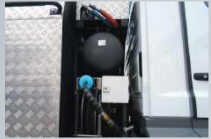
Hot-water cleaning systems

Technical data is subject to change. Pictures are not binding. Not all possible options are presented. For detailed information please contact us.