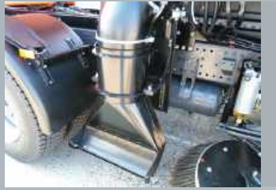
Blower nozzles can be directed manually or from cab