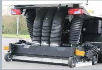
HP bar on sweeping unit