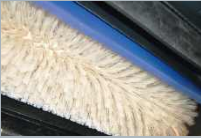
Glycol suction system integrated into sweeping unit