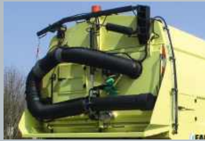
Manual suction system at the rear