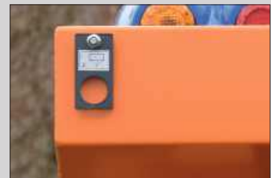
Fitted eyes for lifting the empty spreader.