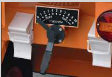
The spreading amount is set using the handle, which controls the spring base adjustment.