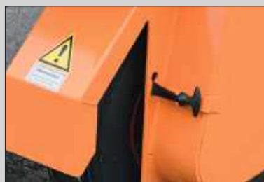
The rubber strap effectively closes access to the transmission system.