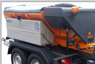
The tarpaulin opens across the entire width of the container and provides optimal filling of the container.