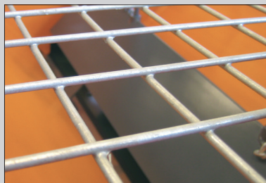
The relief plate limits the weight of the material on the belt (option).