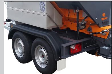
The trailer's 2-axle undercarriage is sprung and equipped with an overrun brake.