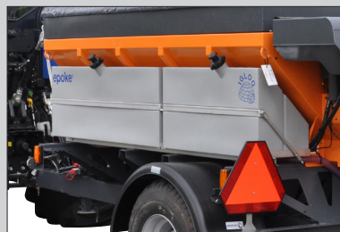
The tanks' wide surfaces provides an effective support, which minimizes the risk of breakage.