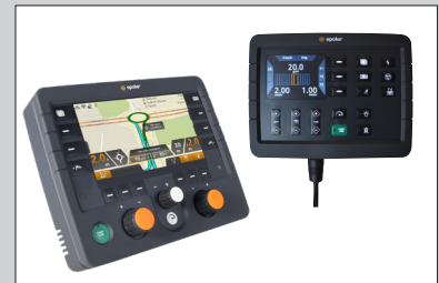
IGLOO Trailer is operated with Epomini X1, EpoMaster X1, or Epomaster X2.