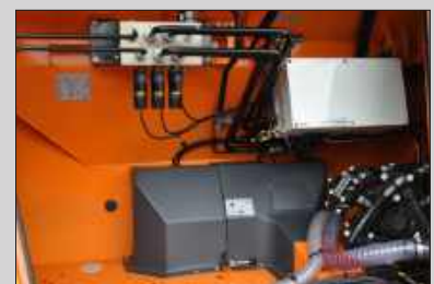
All of the vital components are located in a sealed and locked engine compartment and thus protected from salt dust. The machine is also designed to be user-friendly – both for the driver and service personnel.