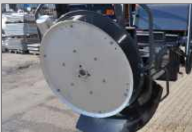
The spreading disc with or without a mixing chamber is selected independently of the spreading material. Efficient spreading at speeds of up to 60 km/h.

This means for example, shorter response times when called out because spreading can be started immediately.