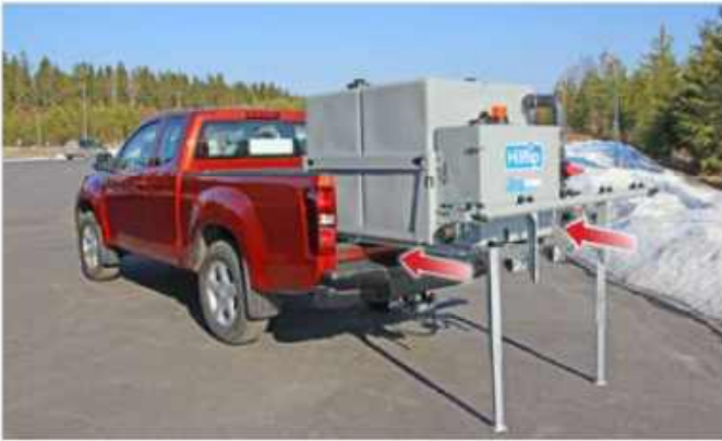
Optional legstand and sliding-tracks on truck bed for easy installation and removing of sprayer.