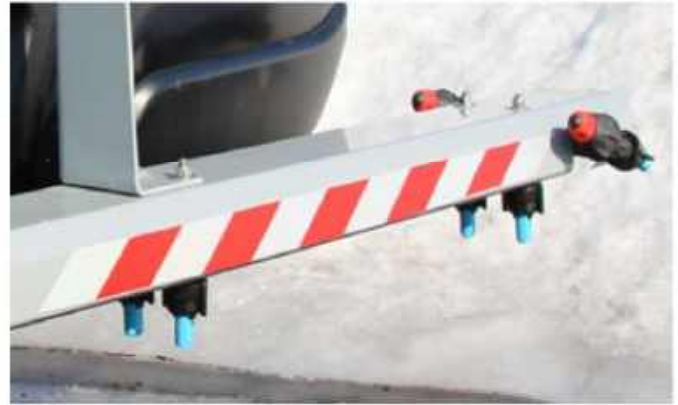
Double spray nozzles for de-icing even in high speeds.