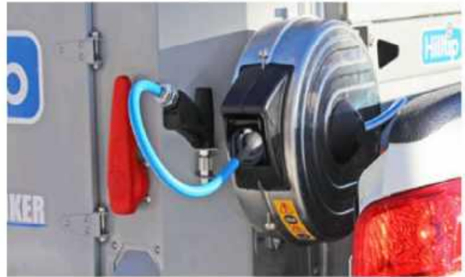
Optional manual hose reel