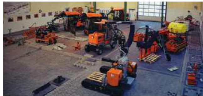
Optimas Visitor and Training Center Ramsloh