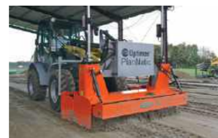
Optional: Hydraulic folding bucket