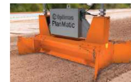
Optional: Side flaps at the front in driving direction