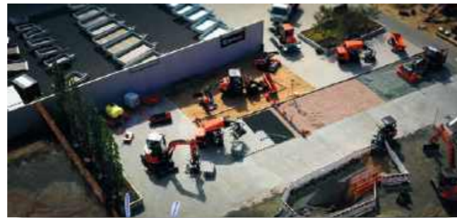
Model construction site at Coreum, Stockstadt a. R.