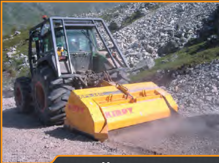
MOUNTAIN CRUSHING WORK: MARKING OUT AND PREPARATION OF SKI PISTES