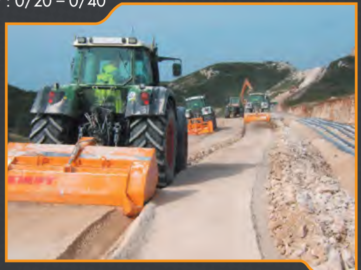
PIPE-LINE LAYING : CRUSHING OF EXCAVATION PRODUCTS FOR LAYING BEDS AND COVERING (PATENTED).