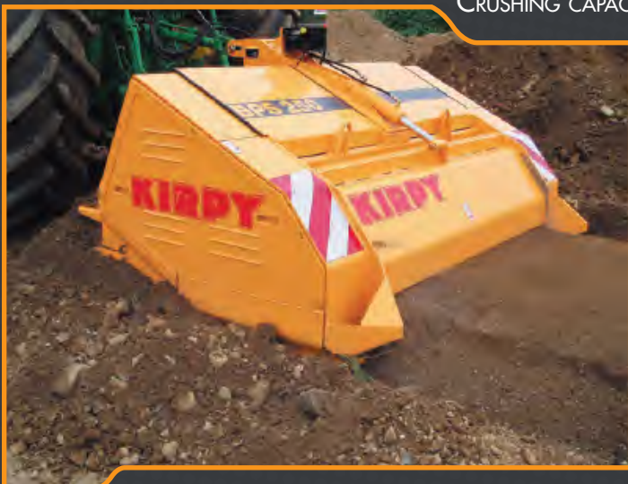
FORESTRY WORK: CREATION AND REPAIRS TO FOREST PATHS OR FIRE BREAKS.