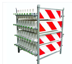
Transport and storage rack