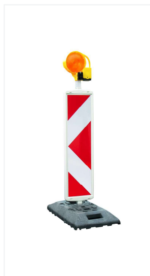
Safety beacon system