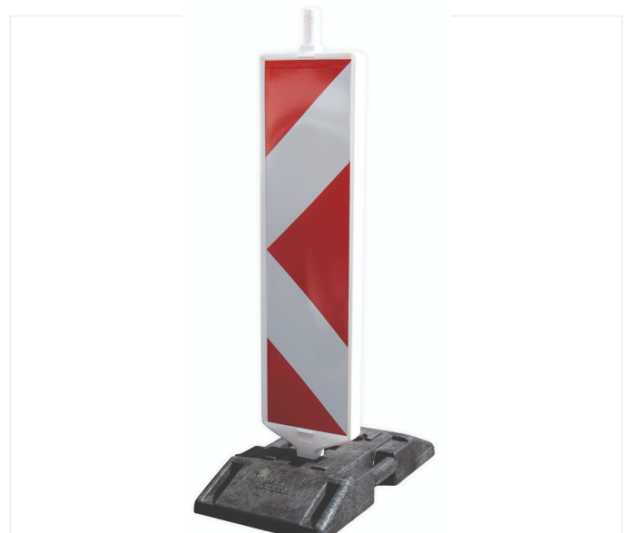
Safety Beacon in base plate Kompakt K1