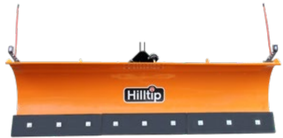
SnowStriker™ SMT in optional color orange

The curved, powder-coated blade is made of high-strength steel, which in this case is the key to our durable but light plow. Two/three segmented cutting edge with trip springs protects the plow and vehicle from impact when hitting obstacles. The cutting edge is available in polyurethane or steel.