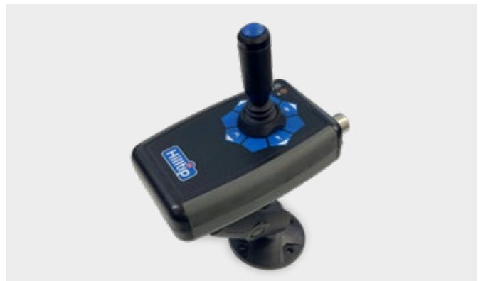
Joystick for v-plow (only on electro hydraulic model)