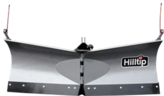
SnowStriker™ VMT in standard color grey