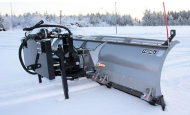
Paralell lifting device for trucks and machines with DIN plate