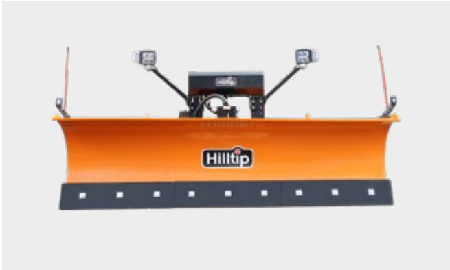
Orange SML snowplow with light tower, optional